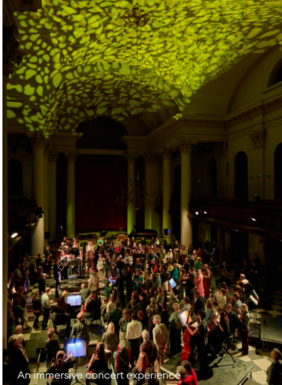
An immersive concert experience