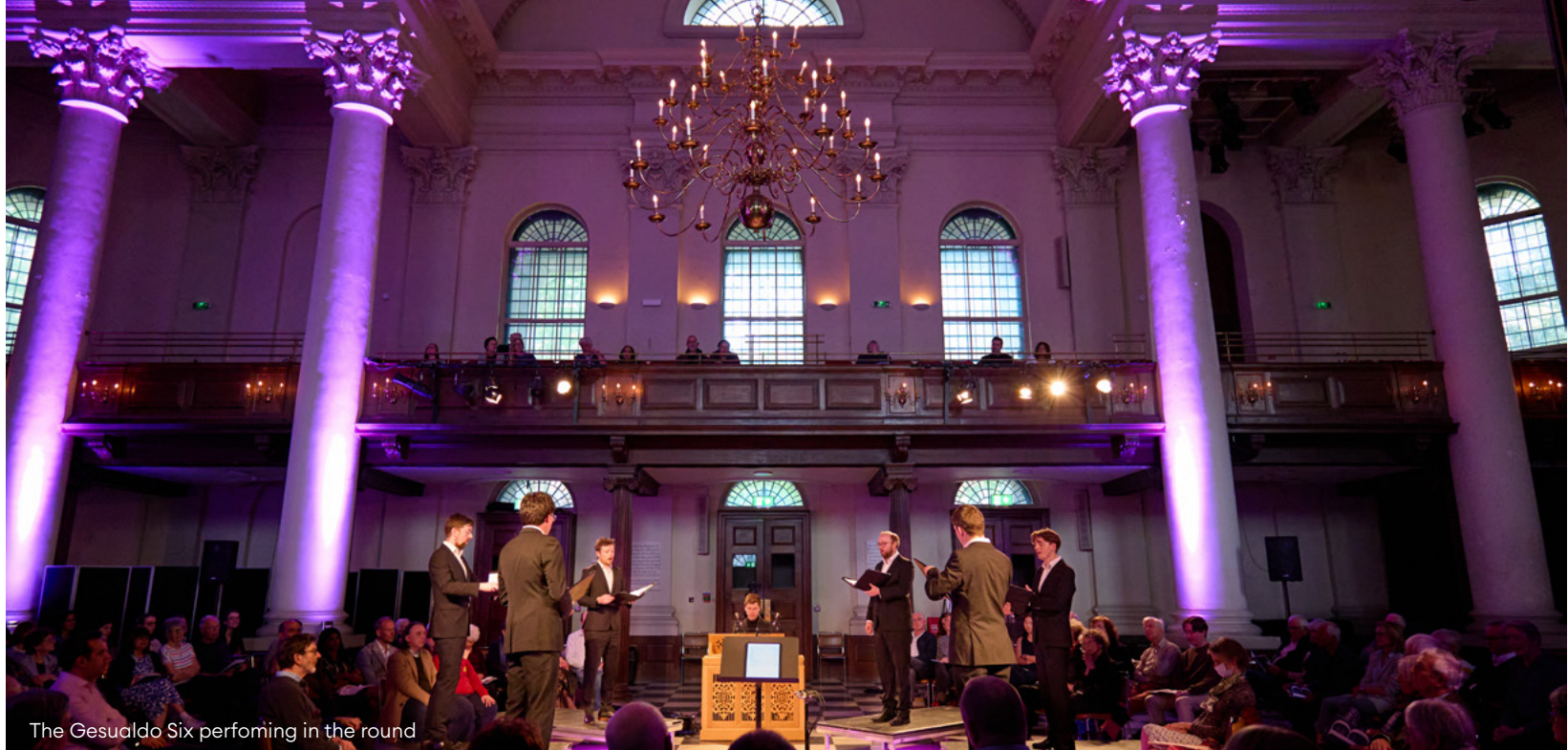
The Gesualdo Six performing in the round